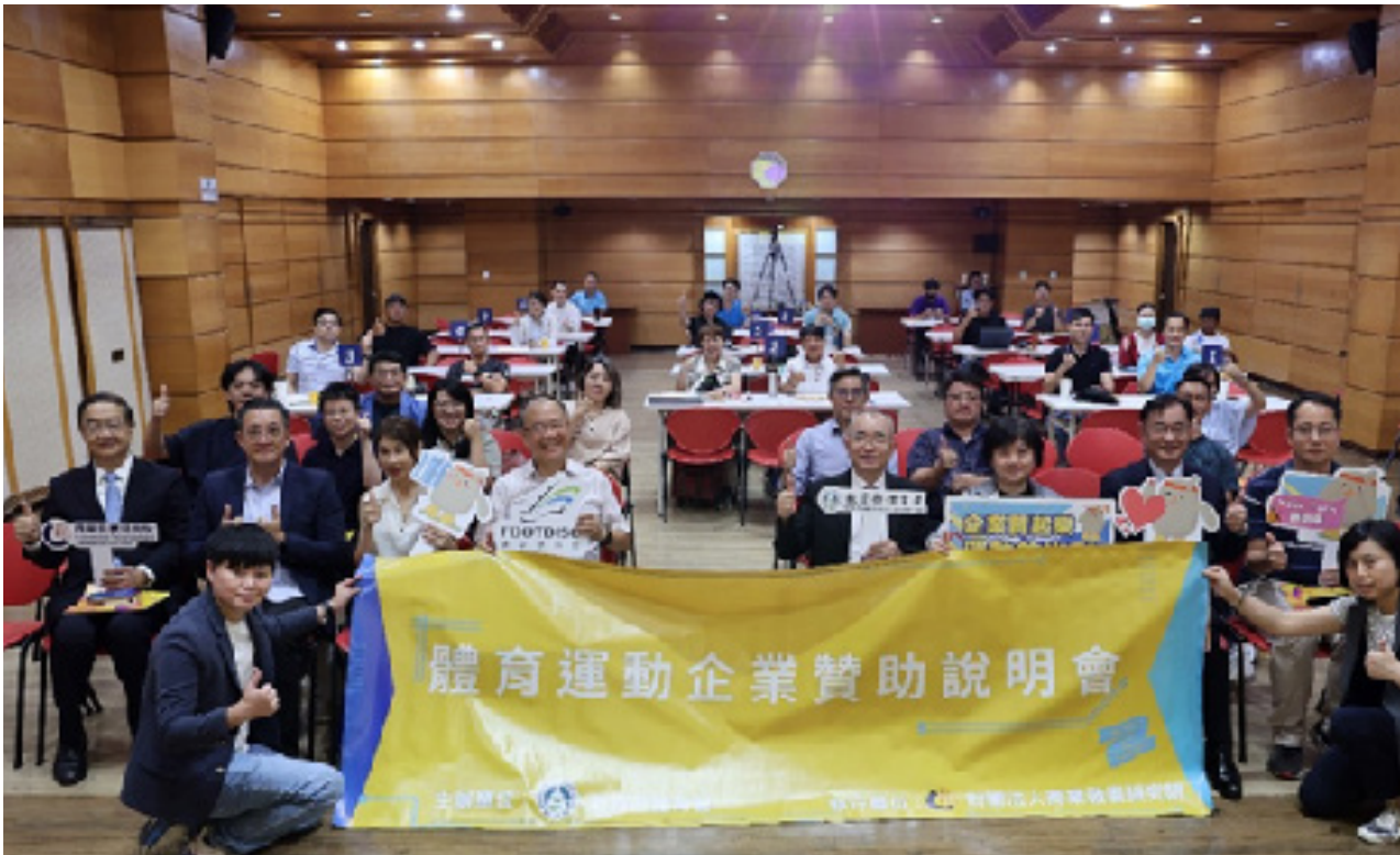
► The Sports Administration Holds the “Corporate Sponsorship for Sports Briefing Session” (Taipei Session)

On August 15, the Sports Administration held the "Corporate Sponsorship for Sports Briefing Session" in Taipei, inviting numerous companies as well as athletes and teams in need of sponsorship to come together. The event's aim was to help businesses better understand the tax incentives provided by the Sports Industry Development Act and to encourage private sector involvement in supporting the sustainable development of domestic sports.