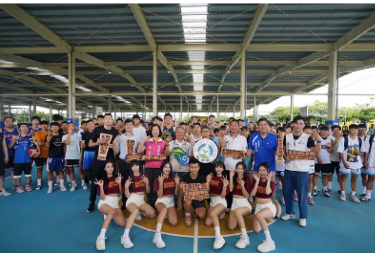
► 82 teams registered to compete in the President's Cup 3x3 Basketball Tournament East Division Preliminary Round

the government is ready to fully promote President Lai's vision of "Making Taiwan Stronger Through Sports."