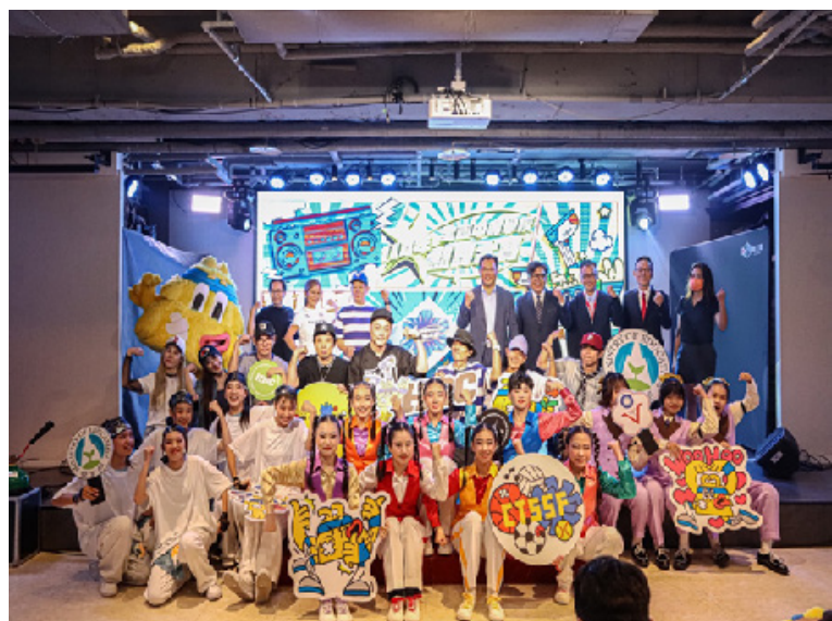
► Youth Explosion Without Limits– Final Battle of the National High School Hip-Hop Dance Competition

joint performance. Alongside the competition mascot Woohoo, they engaged in a dance battle showcasing a wide range of street dance styles and youthful energy. The event also featured a performance by the professional dance crew VHZ Dance Crew, officially kicking off the weekend's grand finale.