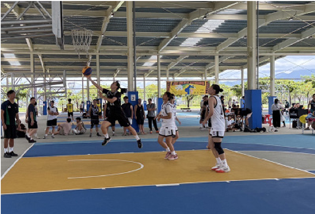
► Top 3x3 Basketball Players from Across Taiwan Compete at Yilan Sports Park Basketball Court for President's Cup Glory